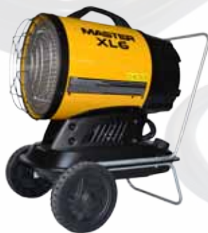
XL 6 trolley